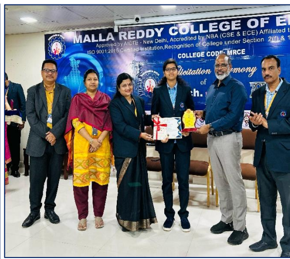
Overall Semester Toppers being felicitated